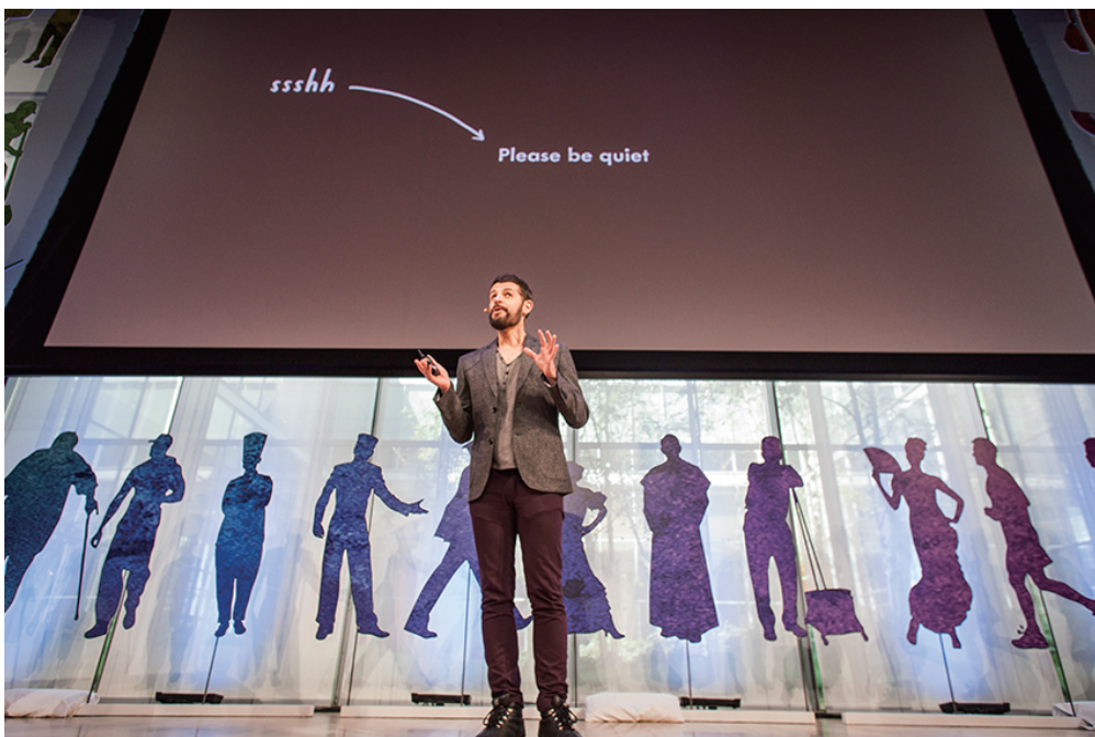
FIGURE 3. TED Talk, New York (Sweeney 2018).