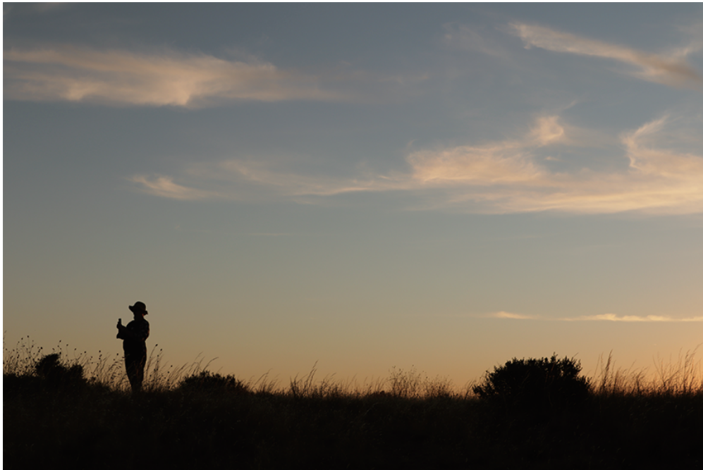
FIGURE 1. Burra landscape (Spratt 2020).

creative non-fiction as a way to represent processes of islands, language, sounds, place, and ways people speak (fig. 2). And Sweeney has always been the silent one with a penchant for being a little more than hushed (fig. 3) and islanded (read: isolated). Our current work with Some Islands is nestled and betwixt methodologically and theoretically two obvious and large disciplines: art and science.