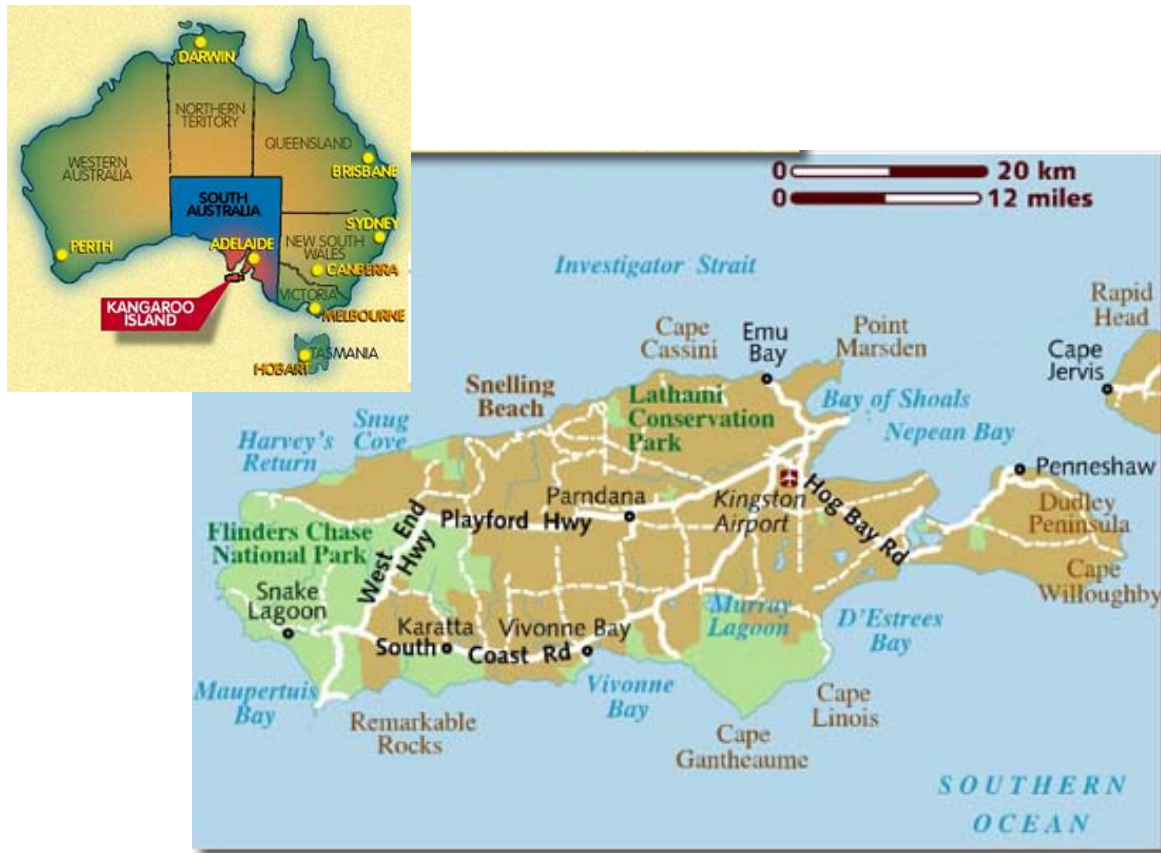
Figure 1: Location of Kangaroo Island, South Australia showing the Dudley Peninsula.

More than 500 non-English, European place-names also dot the Australian coastline. They are testament to the voyages of Dutch and French explorers in the 1600s and 1700s (Tent & Slayter, 2009). It is in looking particularly at the French place-names in South Australia that we arrive at the history of KI, and Baudin's voyage in 1802 on the Géographe .