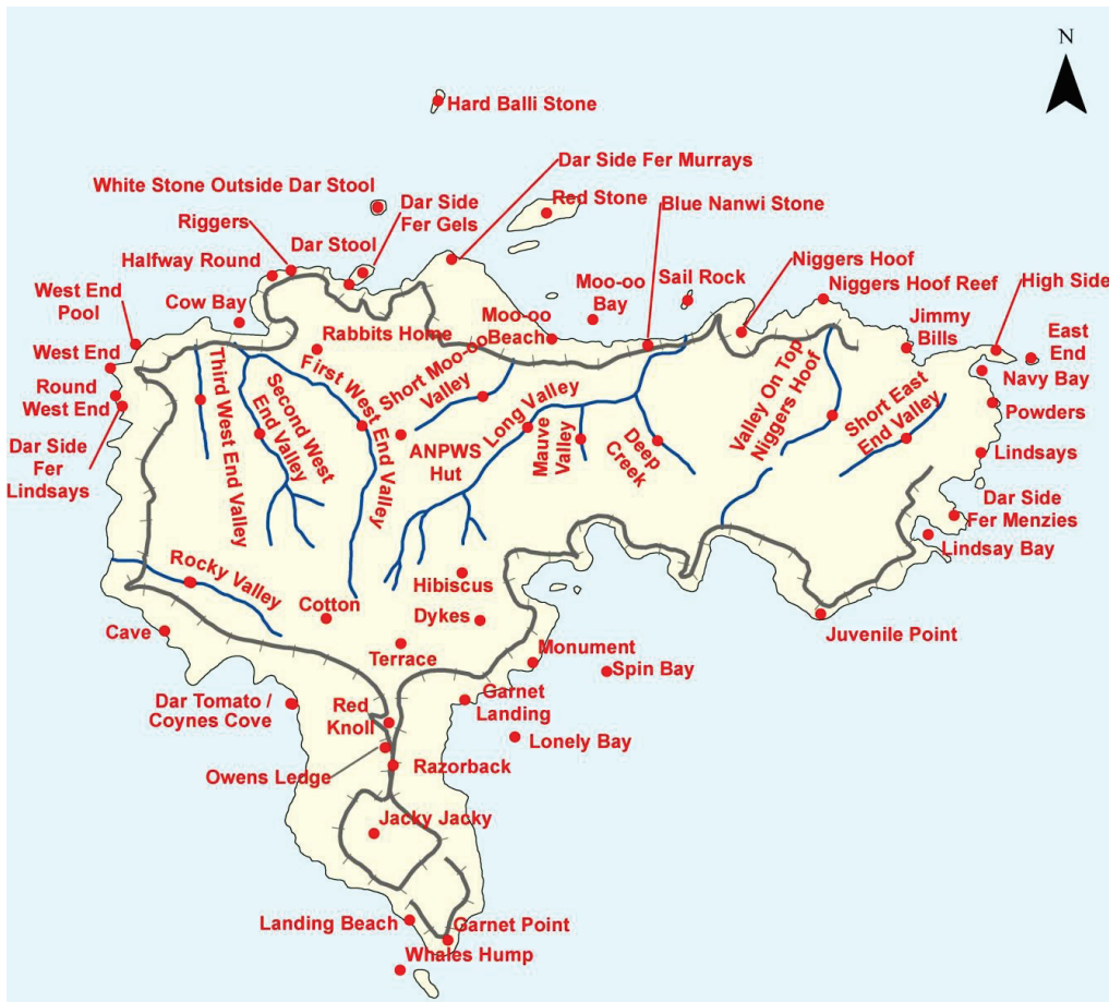
Figure 2. Combined toponymic map of Phillip Island (ANPWS 1989, 8; Nash 2011)