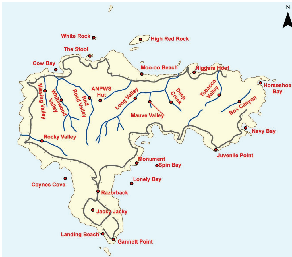
Figure 3. Coyne's Map of Phillip Island (ANPWS 1989, 8 fig. 2.1)