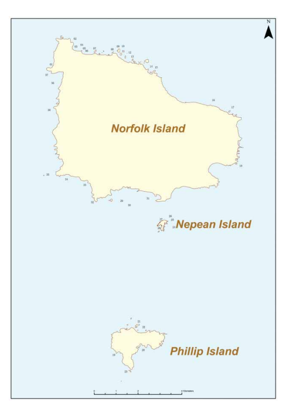
Figure 2. Norfolk Island diving site map (The authors, 2012, based on previously unpublished information compiled by Jack Marges, personal communication, Norfolk Island, February 21, 2008).