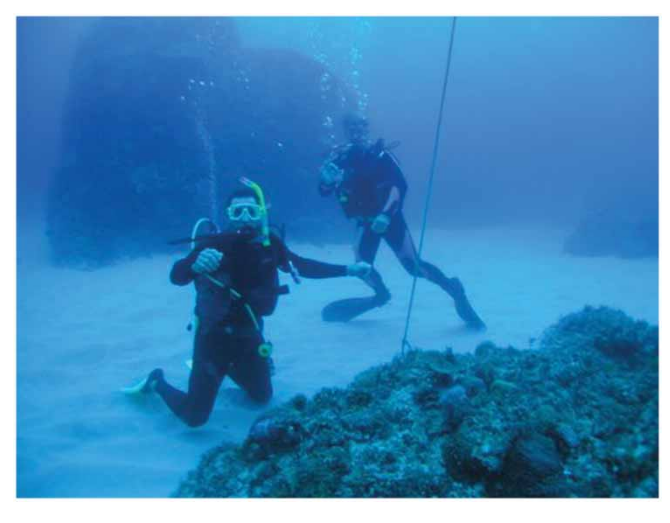
Figure 1. Divers at Little Organ, Norfolk Island (Source: Jack Marges, personal communication, 21 February, 2008).

A search for academic studies dealing with the names of diving sites in the Pacific and elsewhere yields few results. Apart from Nash's (2012a) landscape analysis of Kangaroo Island diving sites, the most comprehensive description of the naming of diving sites is Clark's (2002) presentation of Hawaii's shores, beaches, and surf sites. While many names are presented and although these are commonly connected to other elements of naming of the landscape, e.g. surfing breaks and other terrestrial placenames, Clark only presents names, locations, and brief anecdotal histories of the most well-known Hawaiian