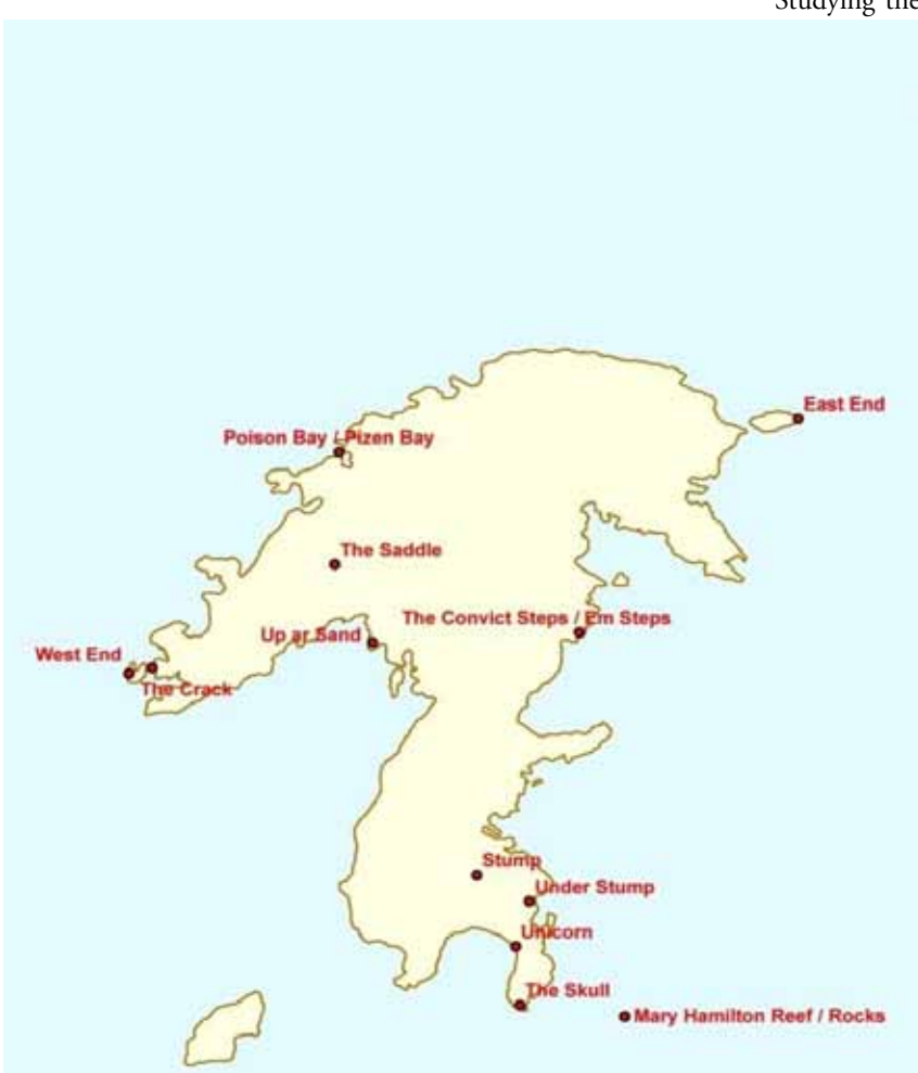
Figure 3: Nepean Island land-based toponyms

Like the larger corpus of Norfolk data presented in Nash (2011: 262-384), the Nepean microcosm presents some generalities that to apply to Norfolk toponymy proper: