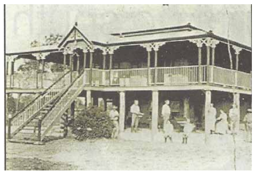
'Allandale' circa 1910

The Homestead district was settled in the 1860s with the establishment of a number of cattle stations. Gold was discovered at Cape River approximately fifteen miles west of Homestead in 1867. The Government Geologist, Richard Daintree, announced in June 1867 his estimate that the Cape River gold field stretched over a length of seventy miles by fifteen miles. The first gold rush in North Queensland ensued.