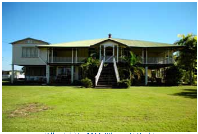
'Allandale' in 2011

its current location in about 1910. There is no record of the previous homestead or other buildings which must have been on the cattle station when the name Homestead evolved for the creek in the 1860s.