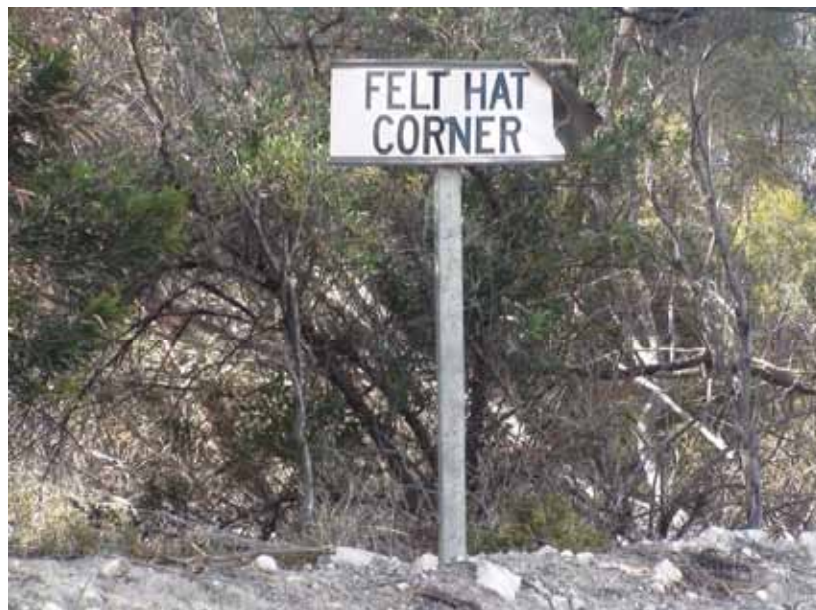
Felt Hat Corner

Many of the Dudley Peninsula names are indeed humorous ( Stomach Ache Corner , Stink Corner ), and may in some cases be linked to particular historical events (for instance, Staggerjuice Corner was so-named by a church-goer in memory of all the alcohol consumed there).