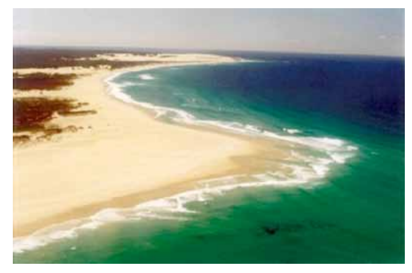
The far point is Cape Howe. Gabo Island is just off Telegraph Point shown in the foreground

But what of the boundary at Cape Howe, Australia's south eastern corner and the New South Wales boundary with Victoria? In 1971 Brigadier Lawrence FitzGerald, in an article in Victorian Historical Magazine , claimed that Telegraph Point, just to the north of Gabo Island, Victoria, was the feature that, in April 1770, Lt James Cook named as Cape Howe.<sup>1</sup> A number of reputable sources have since accepted FitzGerald's claim as correct, and nobody (until now) appears to have challenged it.<sup>2</sup> If FitzGerald is correct, he calculates that about two hundred square miles of Victoria actually belongs in New South Wales.