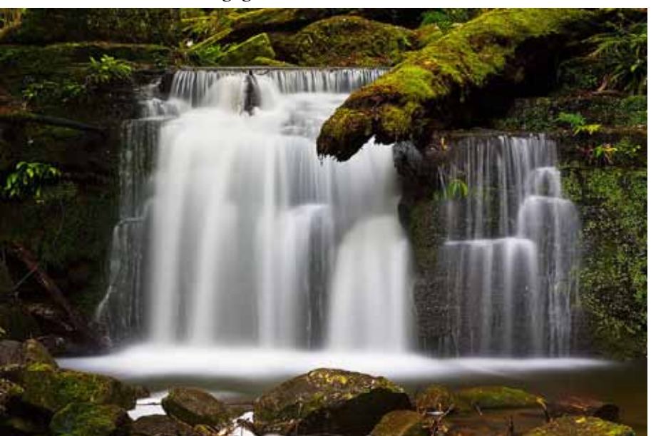
rivulet (< classical Latin rīvulus + Strickland Falls on Hobart Rivulet