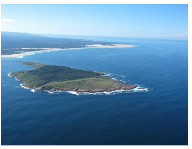
Gabo Island with Telegraph Point, the nearest point on the mainland, and Cape Howe beyond

being in New South Wales, on that State's coast there are 26 toponyms bestowed by Cook. Four of these, Cape St George (actually part of Jervis Bay Territory), Long Nose at Jervis Bay (see Placenames Australia , June 2017), Black Head near Port Stephens, and Point Danger, are in the wrong places on today's maps.