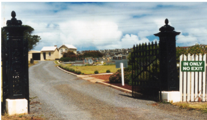
Entry to Cape Bridgewater (Vic.) cemetery