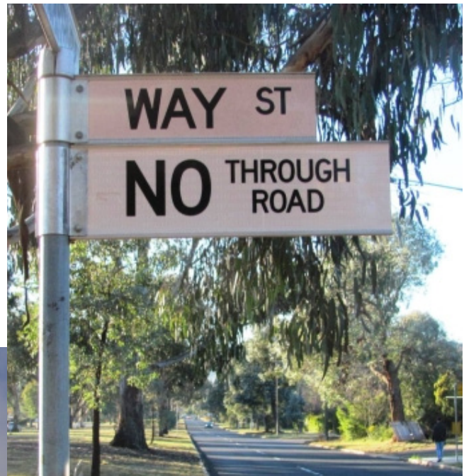
A cul-de-sac in O'Connor, ACT - so, in fact, no way!