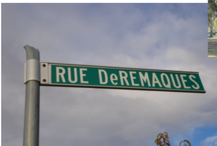
An unofficial sign from Tassie that's not really French at all!