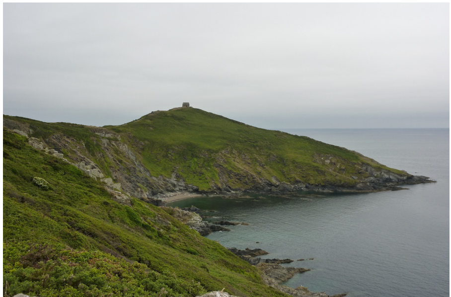
Rame Head, Cornwall (UK).