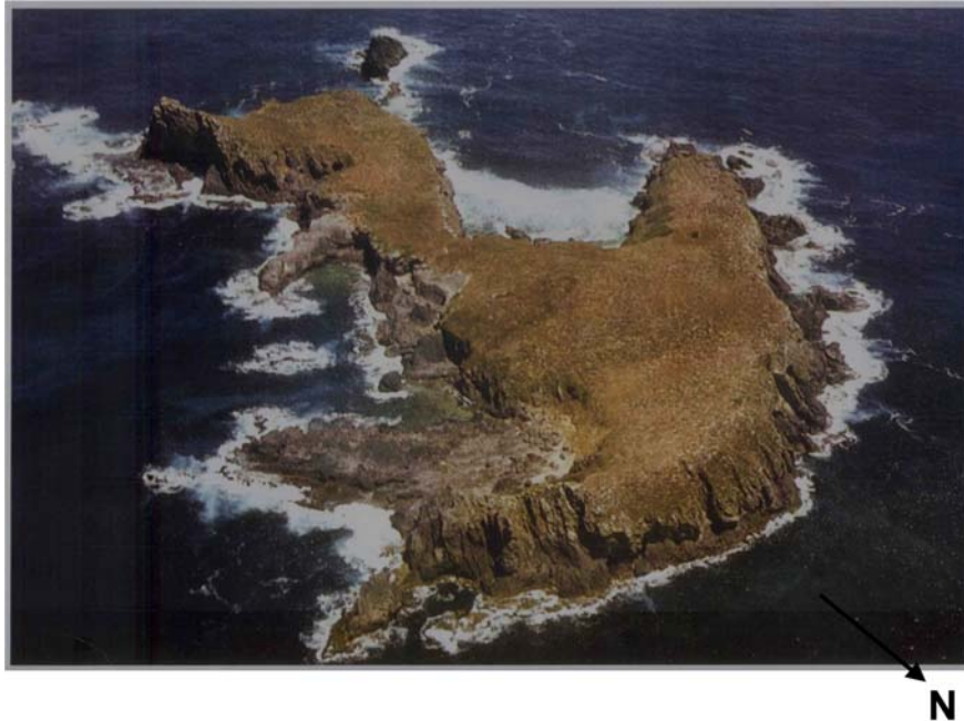
Figure 3. Nepean Island topography

The original vegetation of the island has now been reduced to a low-lying cover consisting mainly of grasses and coastal herbs that are tolerant to the exposed windy conditions. Various weeds such as Poison Weed have occurred on the Island (Green 1973) and this may be one possible etymology of the toponym Poison Bay . Apart from the natural history of the island, the most notable aspect of human intervention is the convict quarry site on the eastern side of the island (Figure 3). These post holes and steps, though greatly weathered since the abandonment of the quarry during the Second Settlement (1815–1855), are still visible and are still utilised for access to higher ground on Nepean.