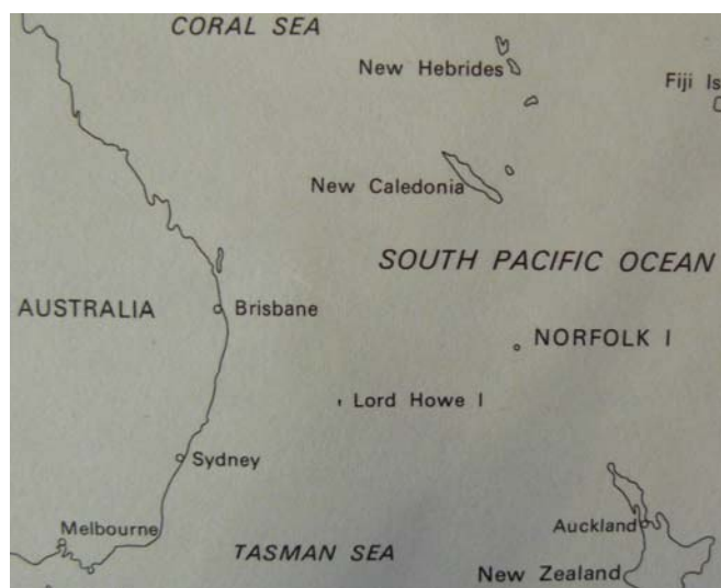
Figure 1. Norfolk Island location map

Norfolk Island, a remote isolated island in the south west Pacific Ocean 1,700 kilometres from Sydney, provides toponymists and linguists a near laboratory case study in naming, toponymy and language change (see Figure 1 location map). Norfolk's isolation and colourful history provides researchers the opportunity to observe naming behaviour in a controlled environment over starkly defined and varied historical periods. The arrival of the Pitcairners on the island in 1856 and the previous uses of the island for agriculture and the British Isles' most notorious penal settlement give a snapshot of language ecology and a prototypical example of the ability of humans to adapt linguistically to a foreign situation.