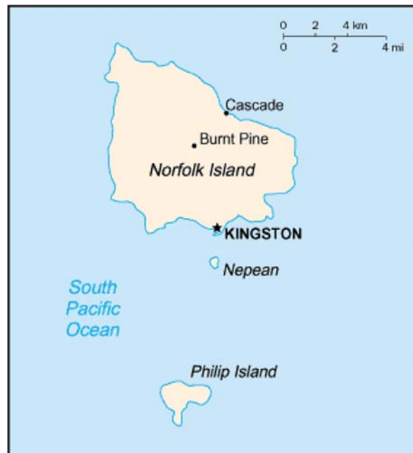
Figure 2. The Norfolk Archipelago

Nepean Island (Figure 2) lies approximately 800 metres to the south of Norfolk Island's administrative centre Kingston. Despite its size Nepean is an important element in the Norfolk landscape; its grassy undulating topography is clearly visible from most vantage points on the southern region of Norfolk. The 200 Norfolk Island pines that used to cover the island are since gone and the physical makeup of the island bears scars from the first two penal settlements, particularly the Second Settlement when sandstone quarrying resulted in the well-known convict steps on the eastern side of the island. The island has had other uses namely fishing and collecting of Whale Bird eggs. Aside from much research into the natural history of Nepean (see references to Nepean Island in Endersby (2003)), management plans for the inclusion of Nepean as a public reserve (Norfolk Island Parks & Forestry Service 2003) and a brief rambler's guide to Norfolk (Hoare 1994), no known documentation of the toponyms of Nepean Island has ever been undertaken.